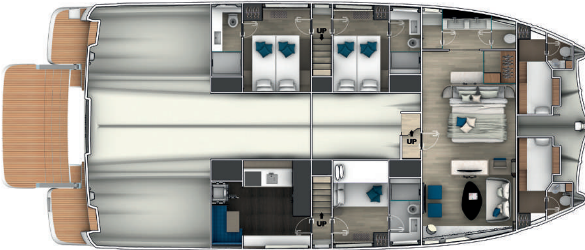
Galley down layout: 4 staterooms, 4 bathrooms