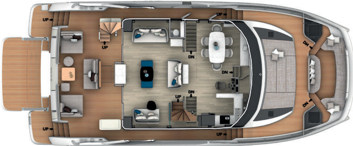
Galley up layout