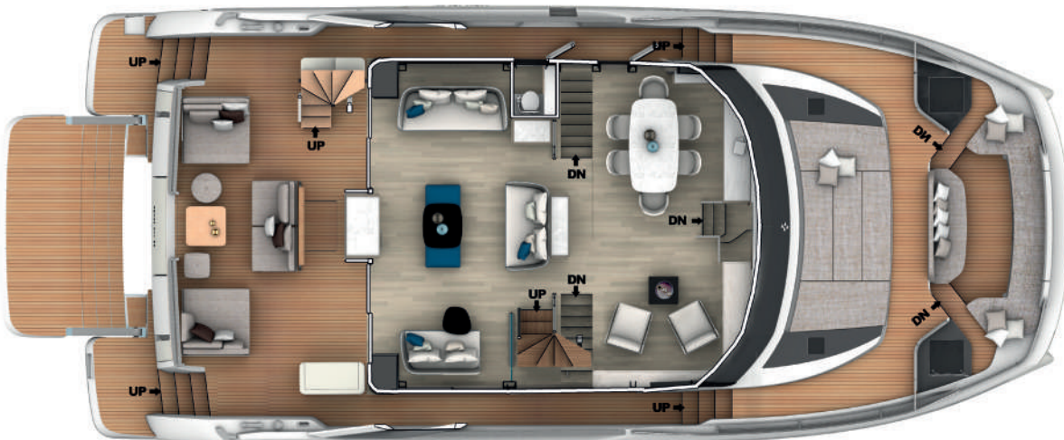
Galley down layout