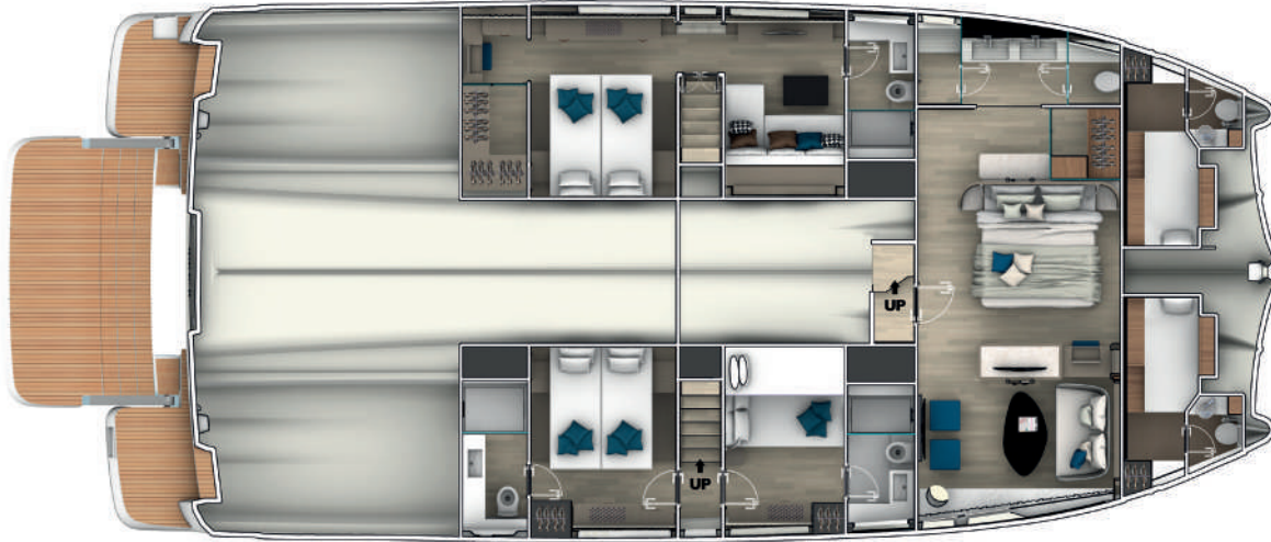
Galley up layout: 4 staterooms / 4 bathrooms