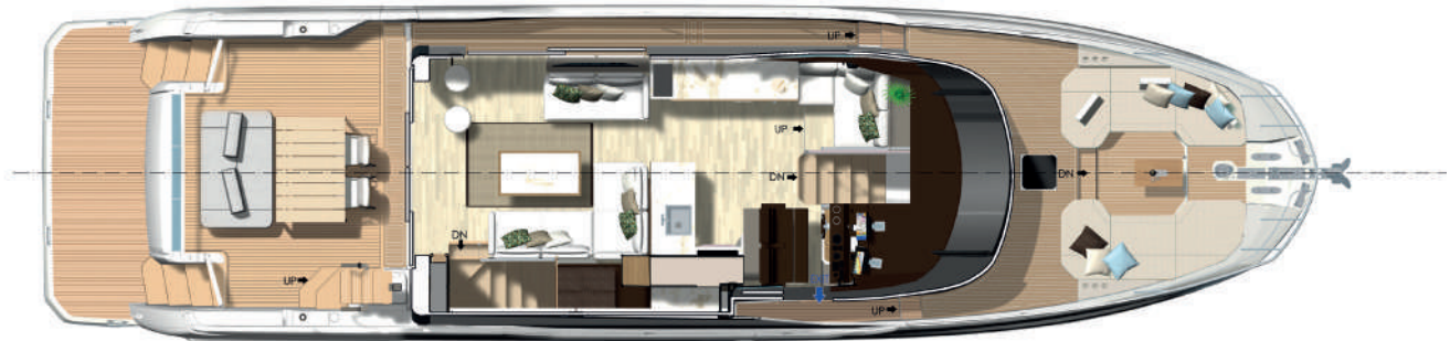
Main deck - Exterior dining version