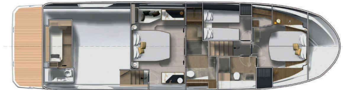
Lower deck - 3 Stateroom 2 Bathroom